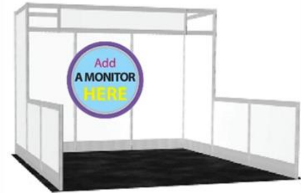
Exhibit space rental does not include any of the following: additional furniture, electricity, internet connection, labor, shipping or any other services. These items should be ordered through the respective vendor forms (see “ Deadlines ”).

Note: Innovation row tabletops include only 1 table and 2 chairs. Walls are not included.